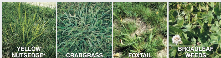
* Suppression only