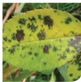
Black Spot on Roses