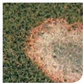
Pink Snow Mold