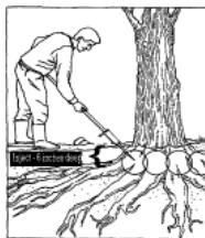
Figure 2. Placement of this product as a soil injected treatment